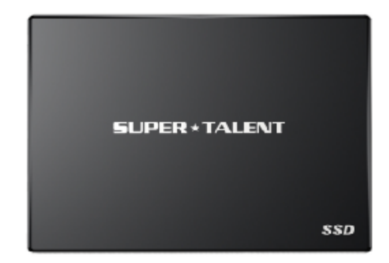
Designed and Manufactured in USA

Write/Erase: >140 years @ 50GB write-erase /day