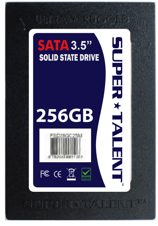
Designed and Manufactured in USA

Write/Erase: >140 years @ 50GB write-erase /day