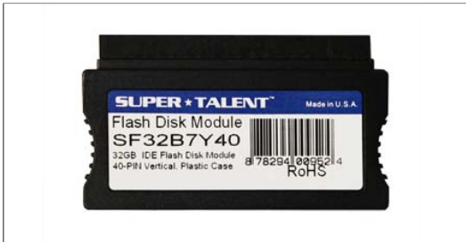
40-pin Vertical Mount FDM