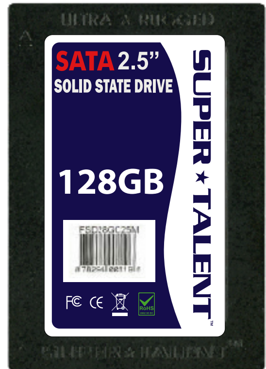
Designed and Manufactured in USA